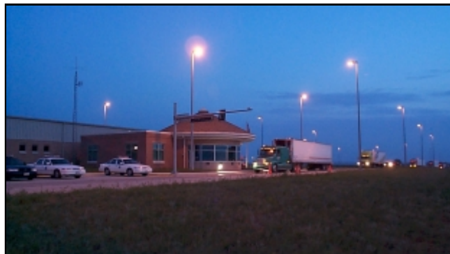
Weigh Station on I-80 near Greenwood, Nebraska